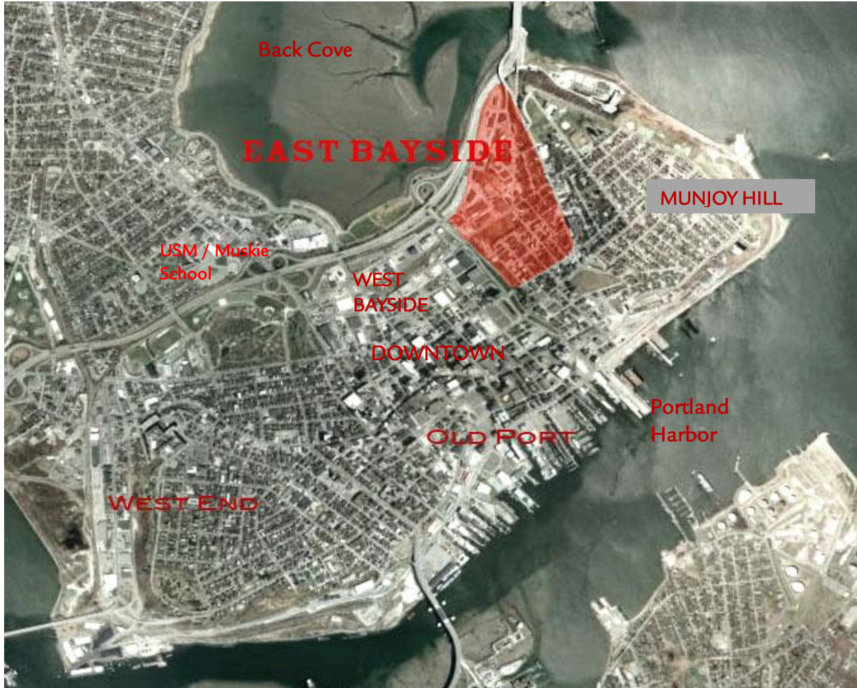
Portland's East Bayside Neighborhood